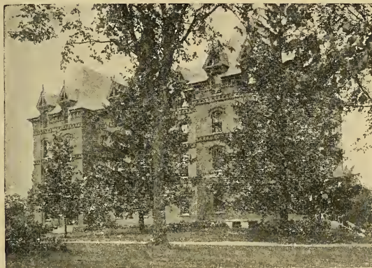
THE NORTH DORMITORY

Rooms will be provided in the College dormitories and in private houses adjoining the College grounds. In general, the dormitory rooms are in suites of two bedrooms, opening into one study room, the bedrooms furnished with single beds. These rooms are nearly all located in two dormi-